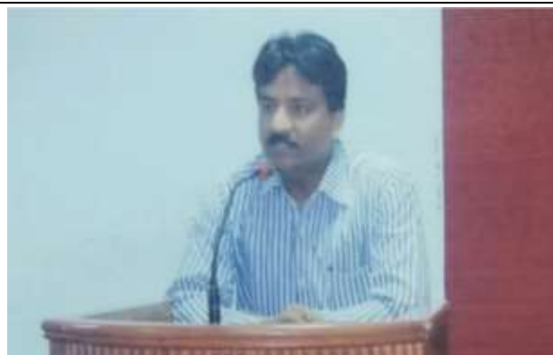
A Guest Lecture on Designing Software